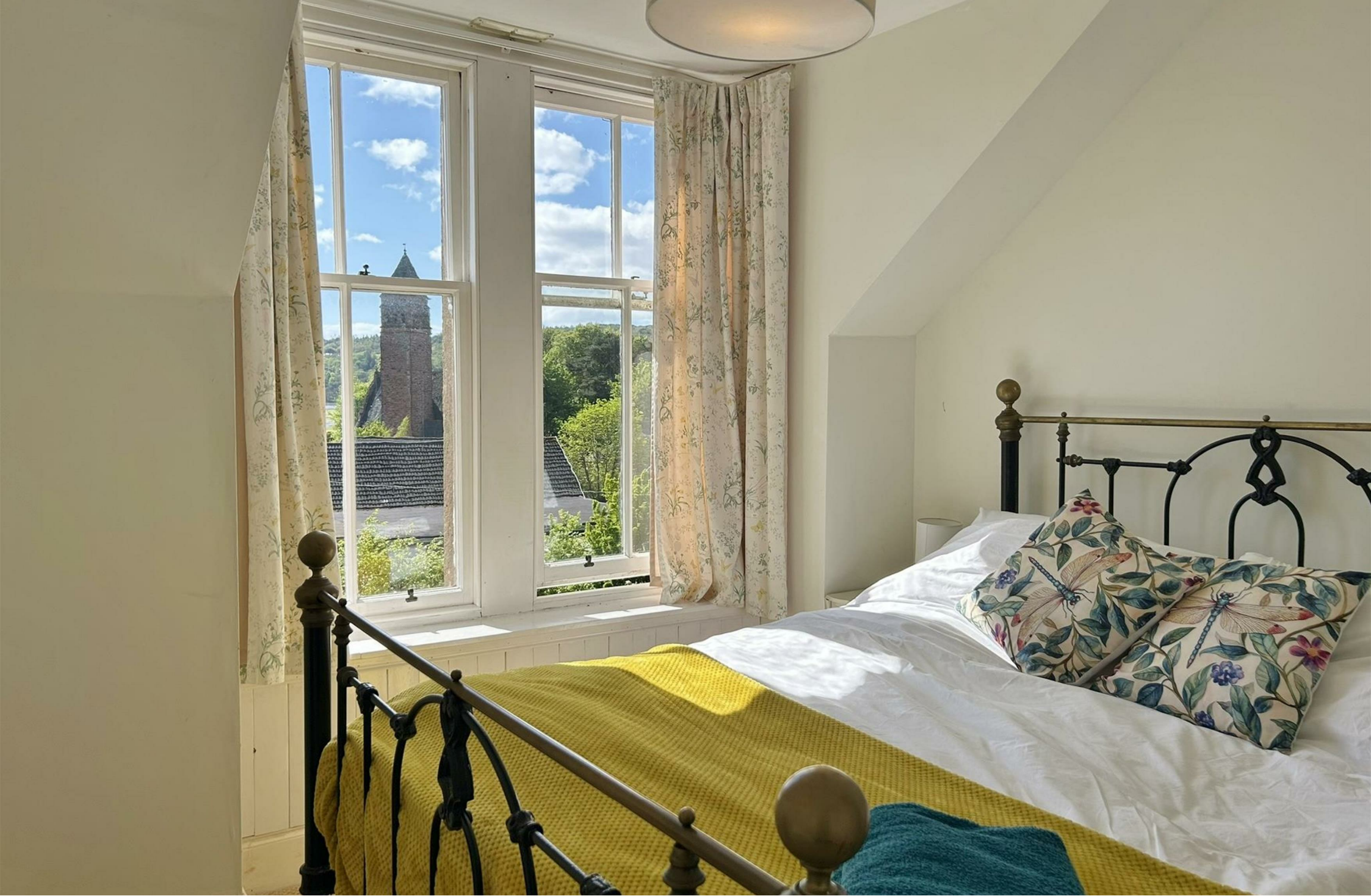
Claveron inc. Flat Lamlash, Lamlash, Isle of Arran, KA27 8NB