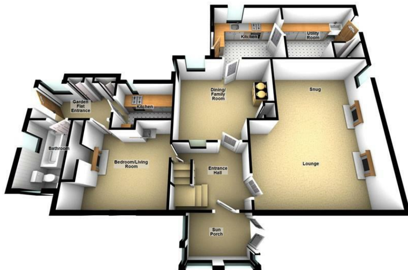
Claveron and Garden Flat